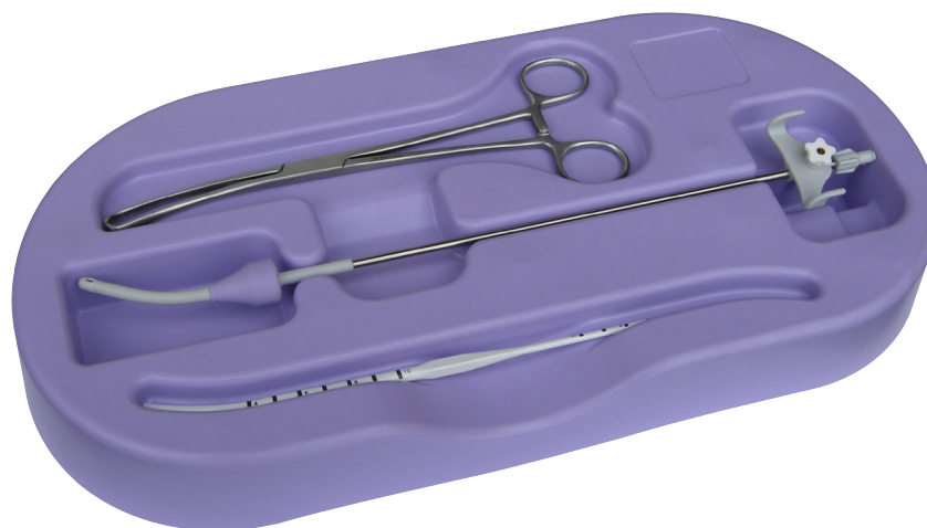
The DiOne disposable Lap and Dye kit.